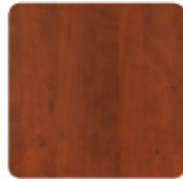
Autumn Maple AM