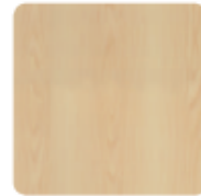
Hardrock Maple HM