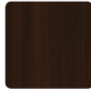
Evening Zen EZ