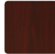
Royal Mahogany RM (Shown Below)