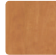
Sugar Maple SM