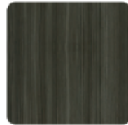
Grey Dusk GD