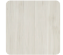
Winter Wood WW